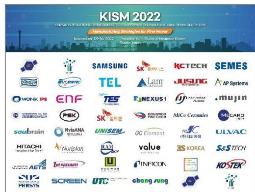
[Sample] Photo Wall